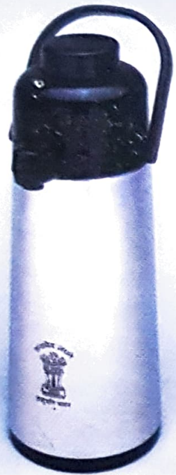
AIRPOT LISA Large Capacity : 2200 ml. Strong Stainless Steel body Highest export item amongst AIRPOTS